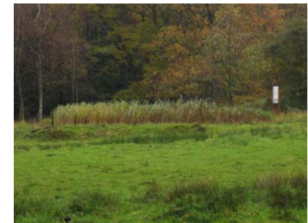
Horizontal subsurface flow constructed wetland, Nassogne, Belgium (20 PE)